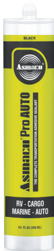
ASMACO PRO AUTO

A hybrid polymer based adhesive for bonding glass and metal.