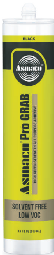
ASMACO PRO GRAB

A hybrid polymer construction adhesive with high initial grab.