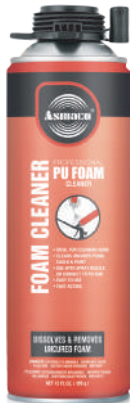
#59001 GUN FOAM CLEANER