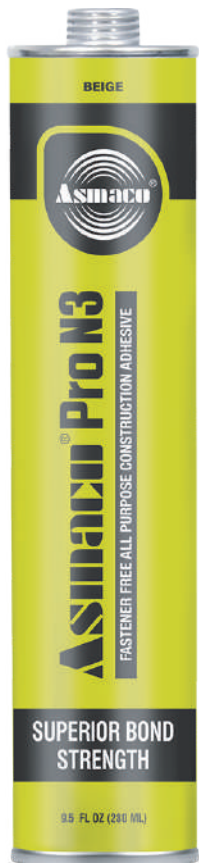
ASMACO PRO N3

A premium general purpose, solvent based construction adhesive.