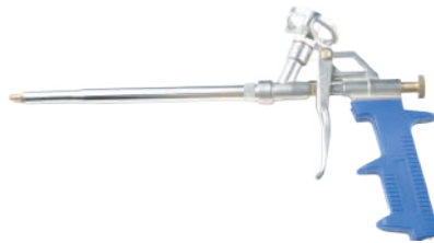
#91002 METAL FOAM GUN