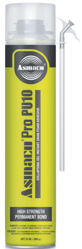
ASMACO PRO PU10

A collapsing gel foam adhesive, ideal for subfloor and panels.