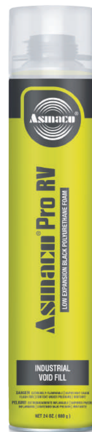
ASMACO PRO RV

A black polyurethane foam designed to for UV resistance.